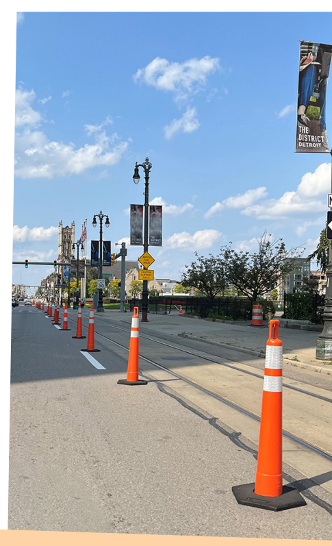
Figure 6: QLINE's tactical transit lane pilot on Woodward Avenue.

In 2022, RTA provided Richmond-Lenox EMS with over $280,000 for service operations, in addition to over $395,000 toward mobility management and vehicle replacements. In September, they began offering same-day demand-