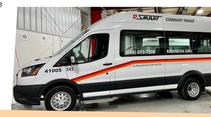
Figure 7: One of North Oakland Transportation Authority's (NOTA) new vehicles purchased with Section 5310 funding allocated by RTA.

This year the City of Ann Arbor created its first Transit Corridor District (TC1), which enables transit-oriented development