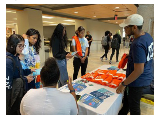
Figure 4: RTA staff promotes transit at a Wayne State Warrior Wednesday event in September.

DDOT survey respondents ranked safety improvements as their second priority after higher service frequencies. To address this priority, RTA has incorporated safety and security into actions focused on transit stops, which can be found in the Plan Updates section of this document.