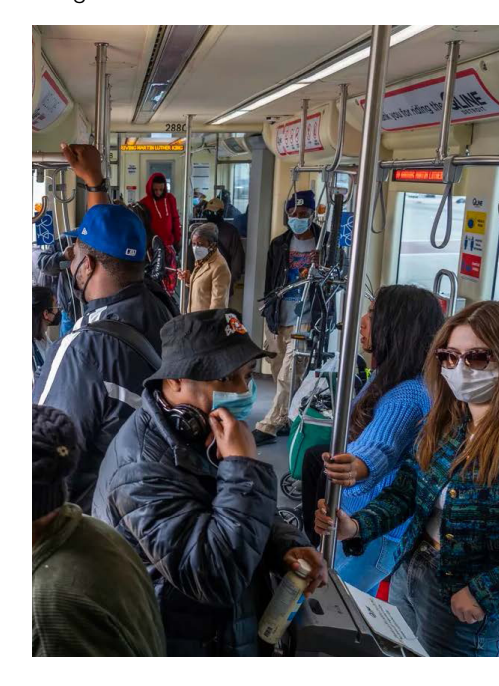
Figure 2: Though it has not reached prepandemic rates, ridership is rebounding.

Additional funding will be available through discretionary grant programs, and Southeast Michigan needs to be ready to submit grant applications in order to bring funding to the region. In 2022, RTA helped MDOT win a $25 million grant for transit, connected and autonomous vehicle (CAV),